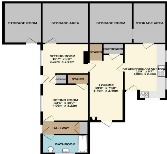
GROUND FLOOR 1070 sq.ft. (99.4 sq.m.) approx.